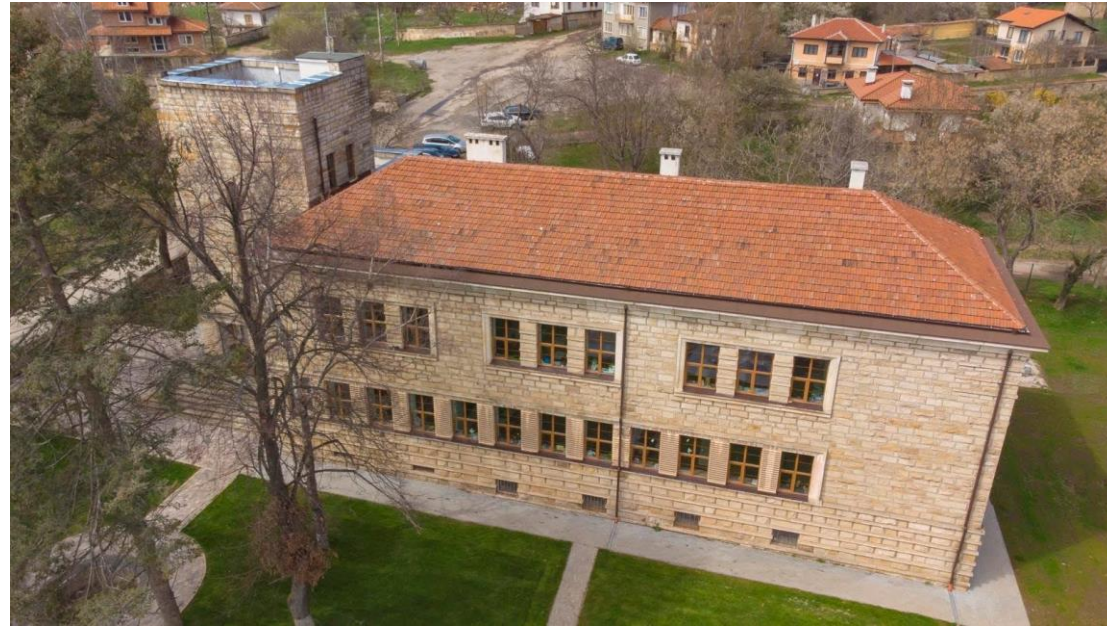
Cosmos International School

Language Practice: Local children will be enthusiastic to practice their language skills with volunteers, providing a chance for cultural exchange and learning.