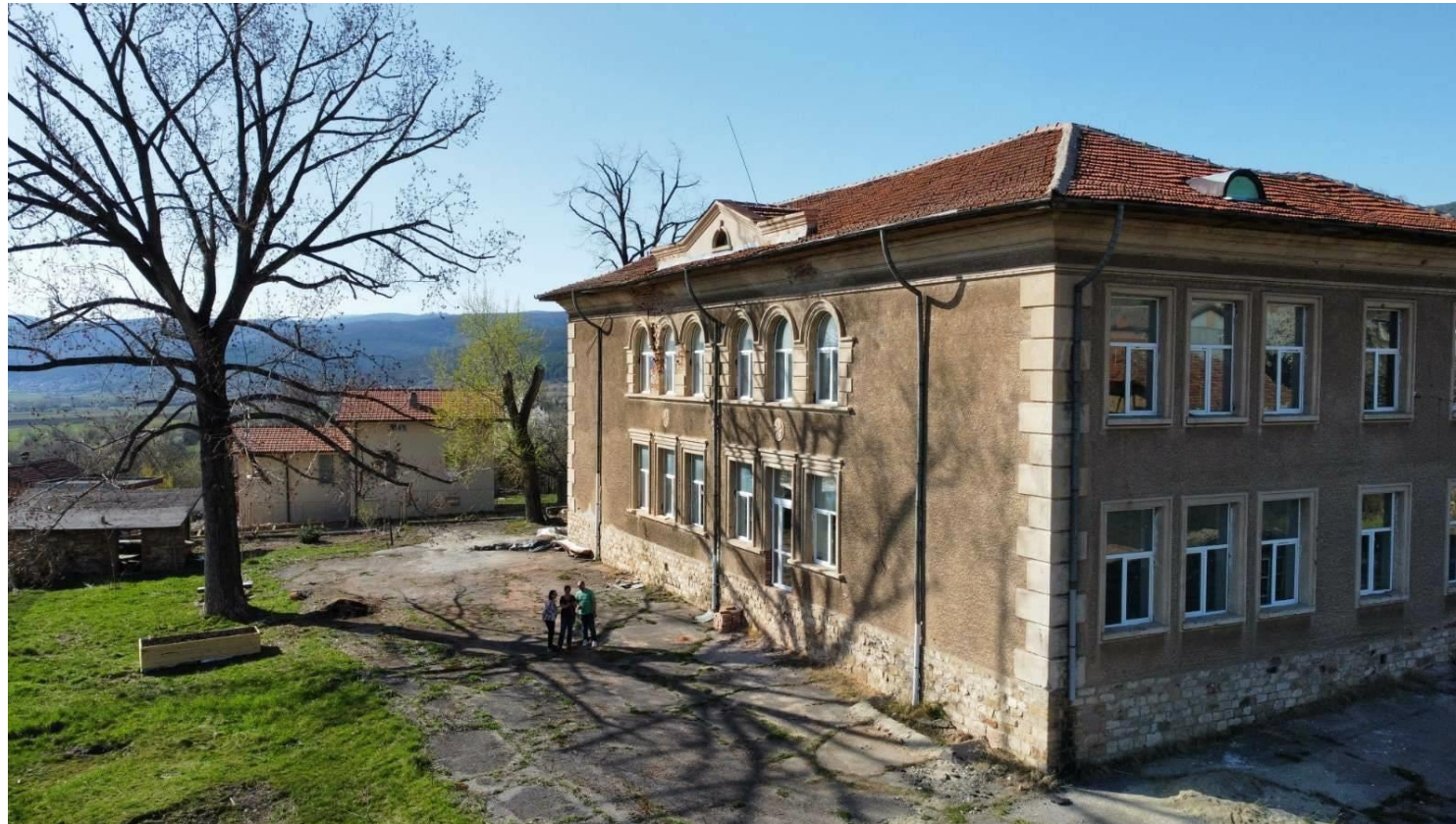
Green Educational Center ELA