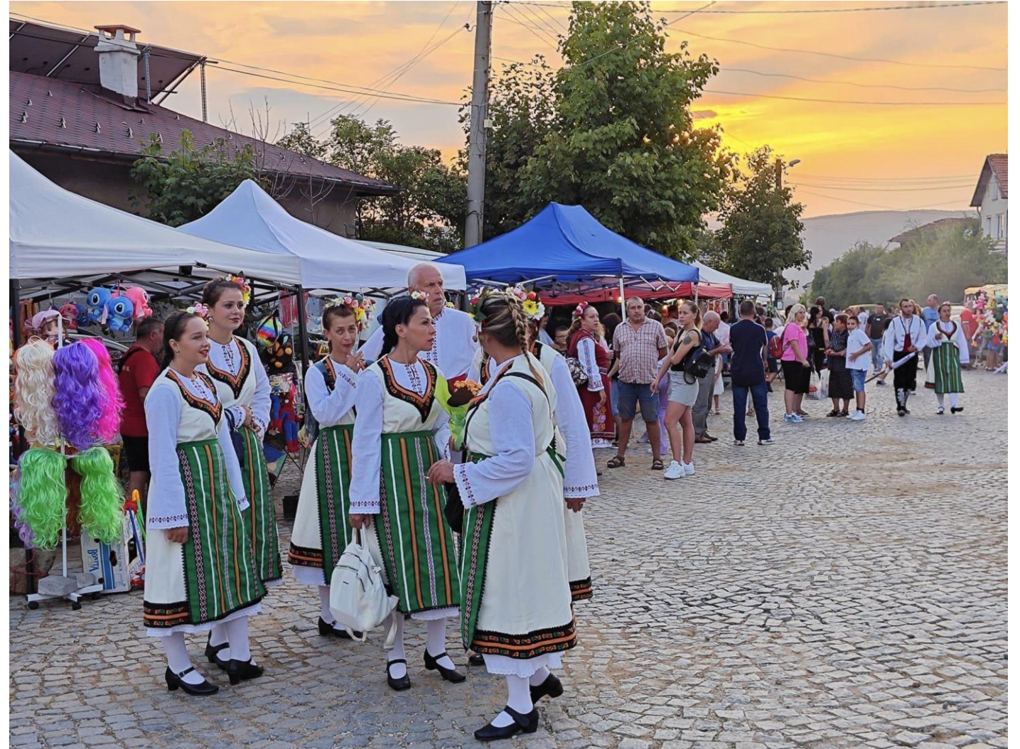
Sturzel Village Festival